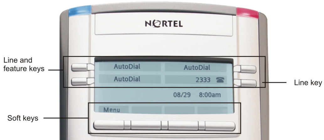
Figure 2: Display area features